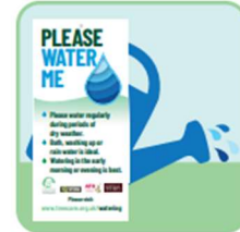
Always water your new tree

Planting a tree is just the beginning... the hard part is making sure that it becomes established in the landscape. It is good practice to put newly planted trees on a young tree maintenance programme for at least two or three years. This can be achieved without huge investment, just some time and attention.