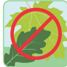
Avoid planting deciduous trees when in leaf